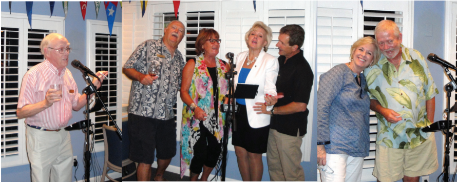
Open Mic every Friday 7 to 10 pm.