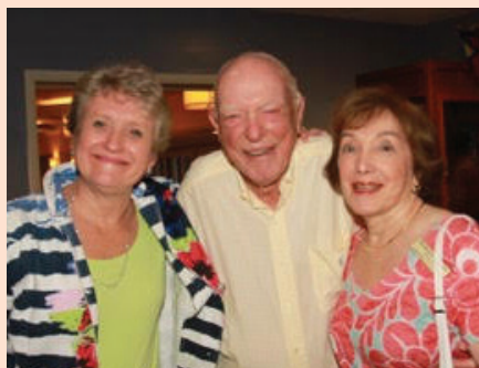
VBYC Bucks winner and admirers! Drawings are Wednesday nights.