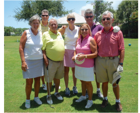
Nine and Dine on 1st & 3rd Fridays. Sign Up on Burgee Bulletin Board.